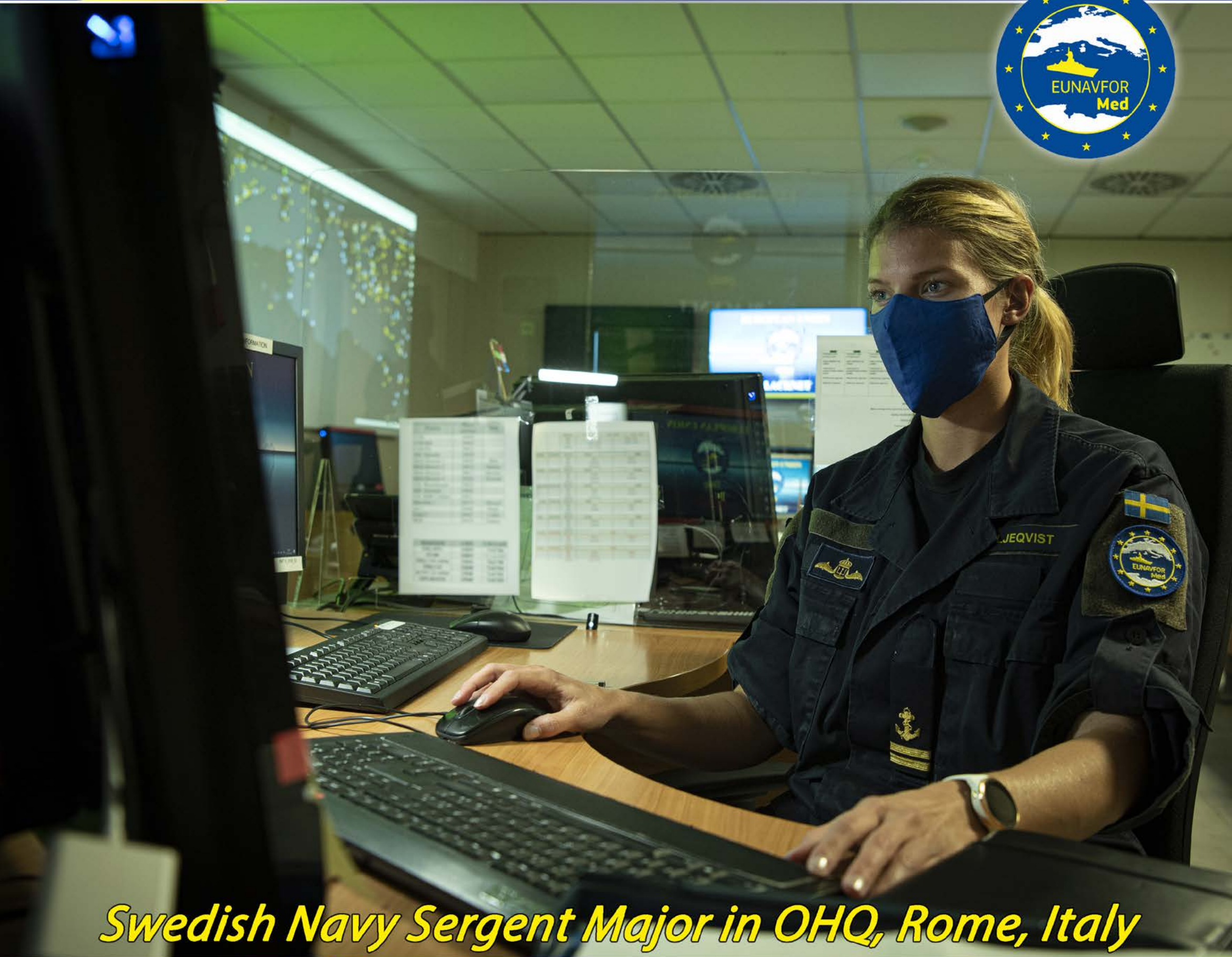
Swedish Navy Sergeant Major in OHQ, Rome, Italy