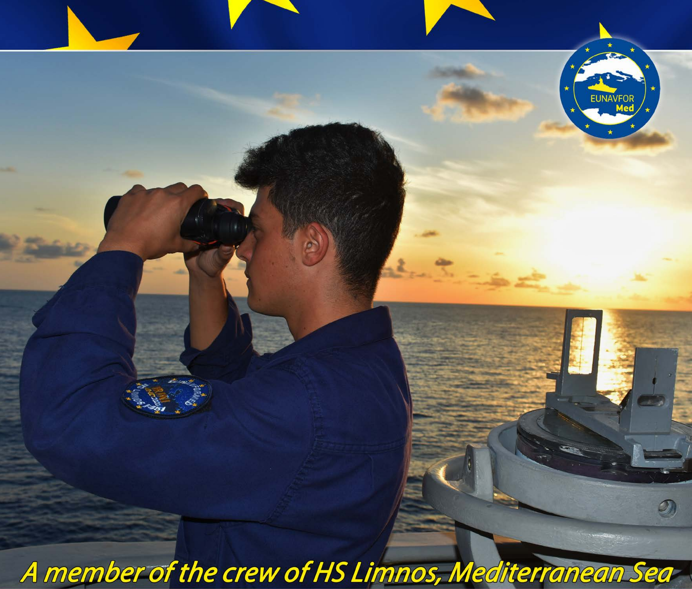
A member of the crew of HS Limnos, Mediterranean Sea