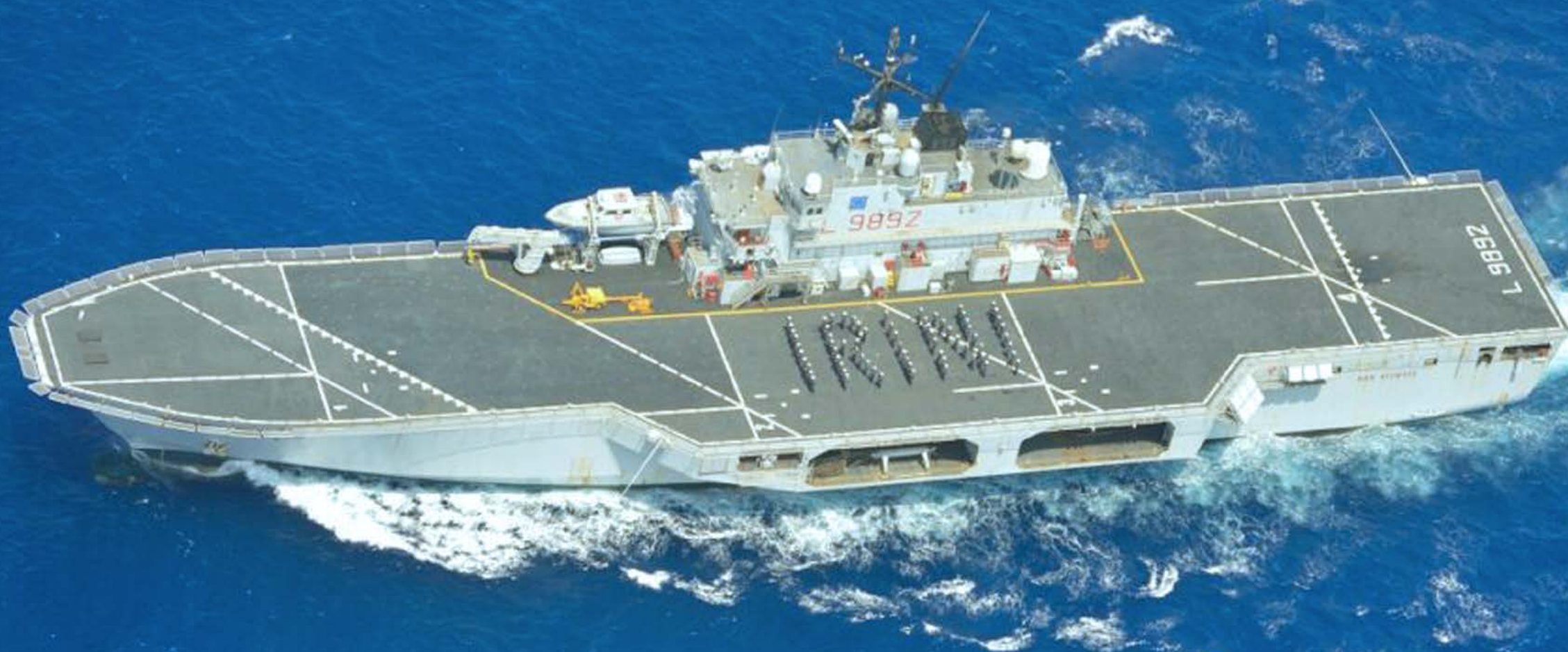
ITS San Giorgio, Mediterranean Sea