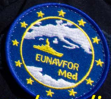
A member of the French navy during a boarding