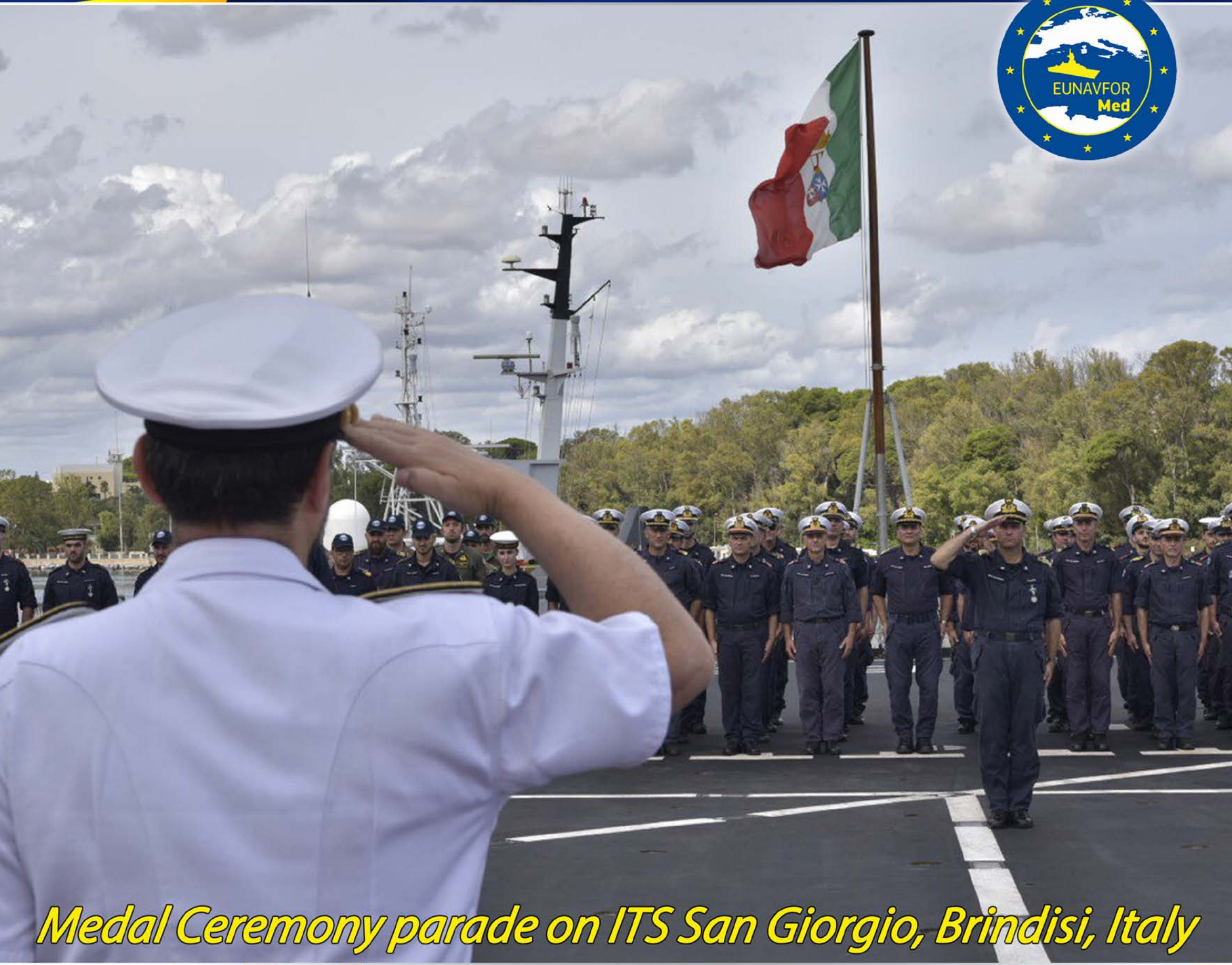
Medal Ceremony parade on ITS San Giorgio, Brindisi, Italy