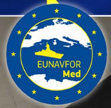
Captain of the Polish Navy, Sigonella, Italy