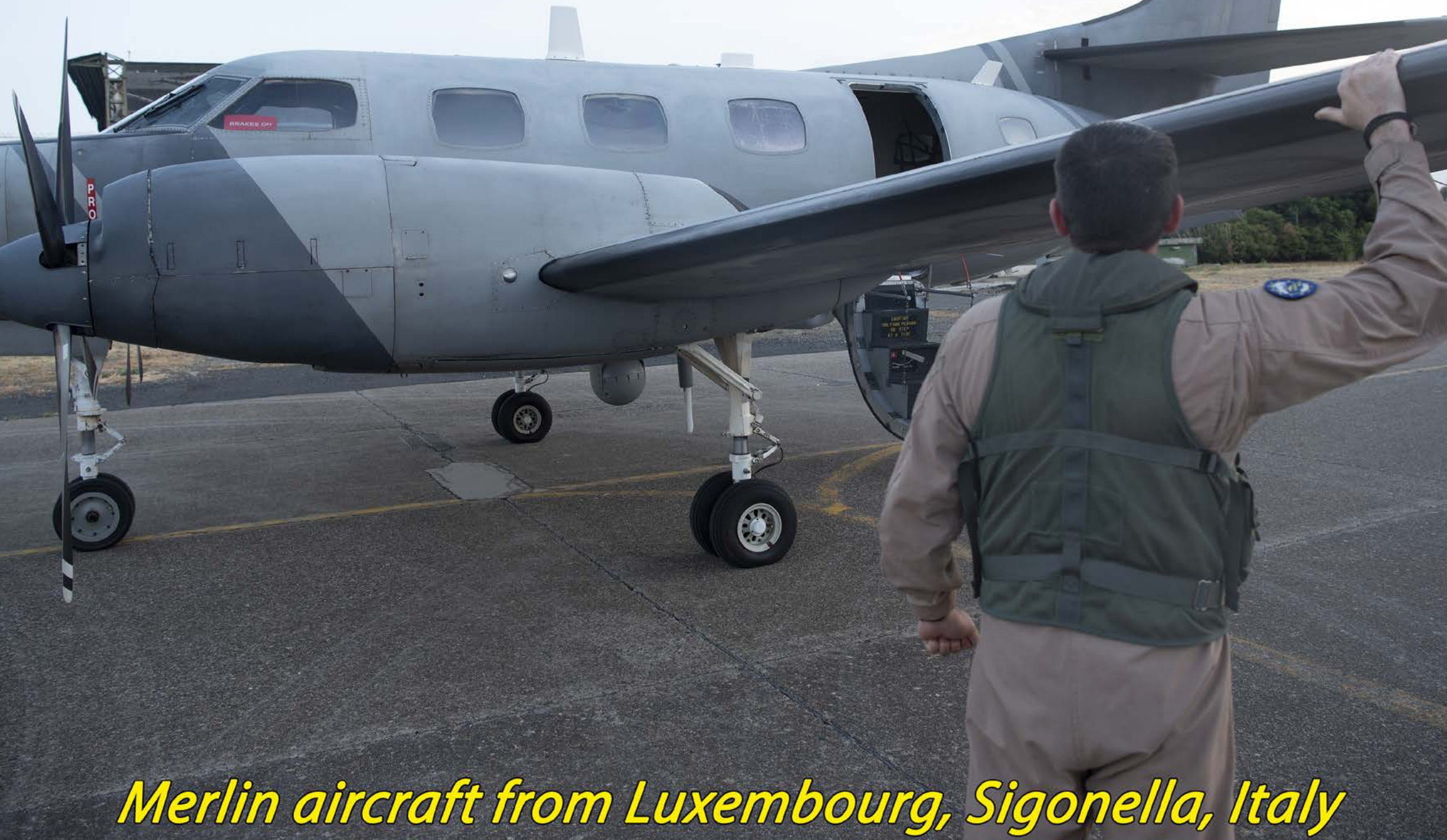
Merlin aircraft from Luxembourg, Sigonella, Italy