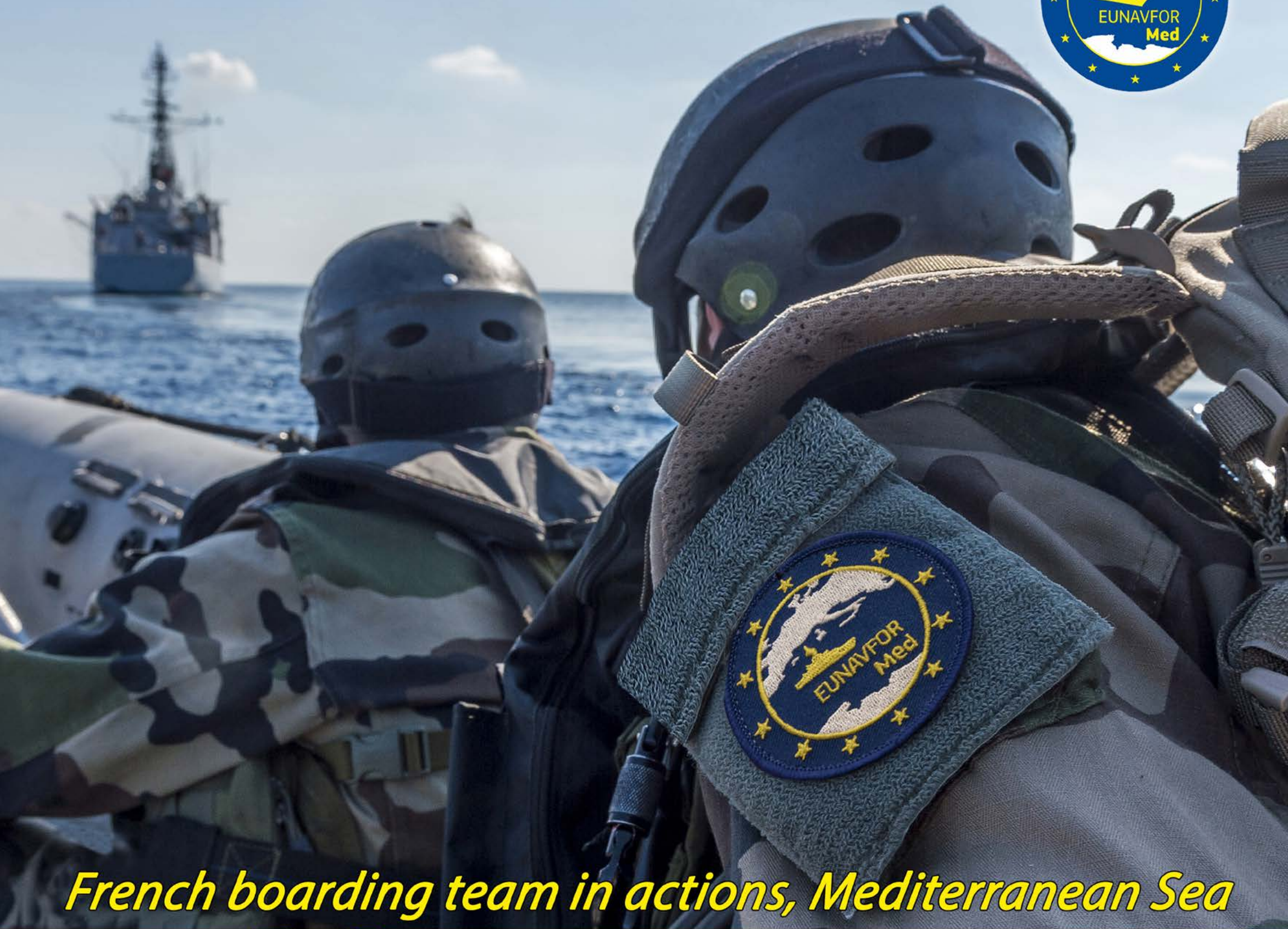
French boarding team in actions, Mediterranean Sea