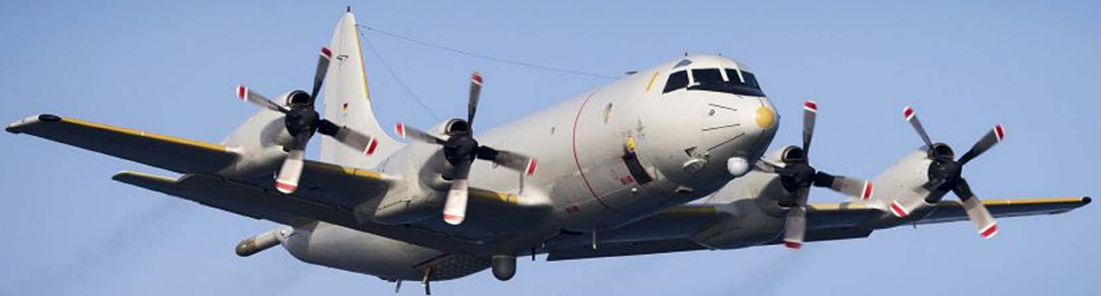
German P-3C Orion